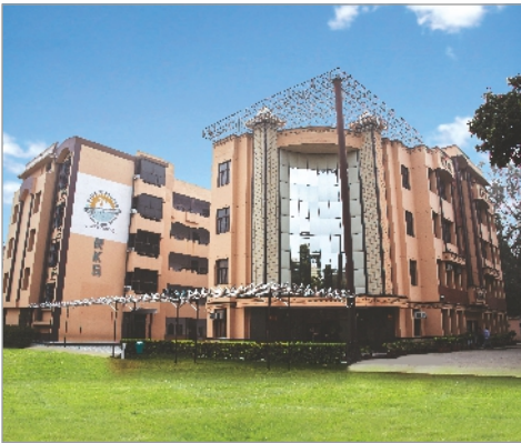
Ramakrishna Senior Secondary School