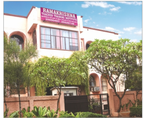
Ramakrishna Teacher Training Institute