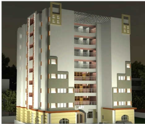
MERI Management Education and Research Institute